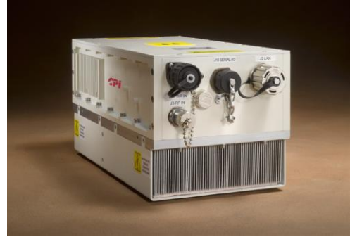
CPI GaNLink™ 80 W Ka-band GaN SSPA / BUC, Model SA49KOA / SB49KOA

Backed by over 40 years of satellite communications experience, and CPI's worldwide 24-hour customer support network that includes more than 20 regional factory service centers.